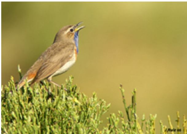
Bluethroat (Javi Ruiz)

Day 6: We drive back to Madrid airport aiming to arrive there at 15h00, making various stops along the way and keeping an eye open for the many raptors that soar through the sky above these vast plains of Extremadura and Toledo, with the Gredos Mountains in the background. Our final halt before heading towards the airport will be for a drink and some typical Spanish tapas by the medieval castle of Oropesa from which we shall enjoy spectacular views of the landscape and the acrobatic displays of many Swifts, Swallows, Martins, and Jackdaws.