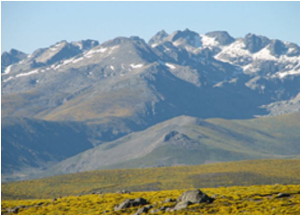
The Gredos Mountains (Claire Graham)

Gredos Vivo (The Living Gredos) organises tours in Western Spain: in the centrally located mountain range of the Gredos , to the North in the plains, wetland areas and river canyons of Castille , and to the South in parts of Extremadura . Various itineraries are offered to explore different areas of this still little known yet beautiful and biodiverse part of Spain. The tours are led by Claire Graham at a leisurely pace to enjoy and take in the landscapes whilst discovering their birds and other wildlife; a chance also to enjoy the local culture, tradition and gastronomy. There is no rushing from one place to another to tick as many species as possible. Walking is generally easy unless otherwise specified, generally not more than 2-3 miles at a time.