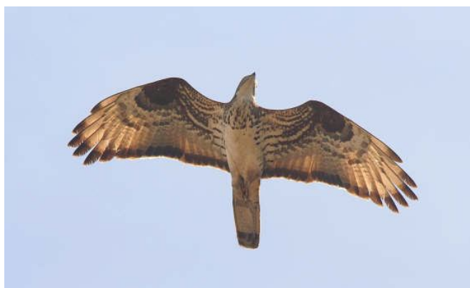
Honey Buzzard (Chema García)

A spring holiday based in a single hotel exploring the wide diversity of birds found in the varied habitats of Extremadura , one of the best birding areas in Spain: the National Park of Monfragüe, dehesas , steppes, small wetland areas and the foothills of the Gredos mountain range.