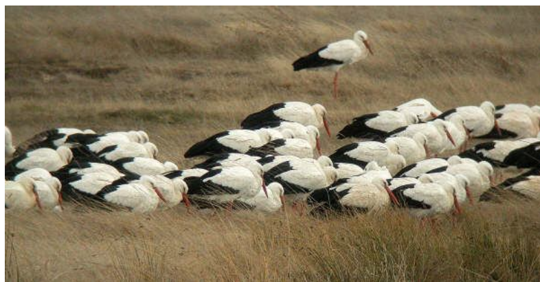
White Storks (Chema Garcia)

Day 6: We return to Madrid with possibilities of various stops along the way depending on time and birds that remain to be seen. We aim to be at Madrid airport by 14.00 hours.